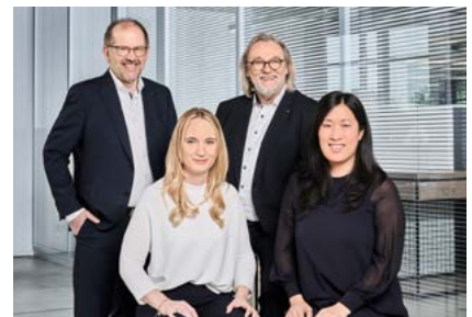
Fourth generation joins executive management