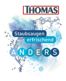
Download photo material